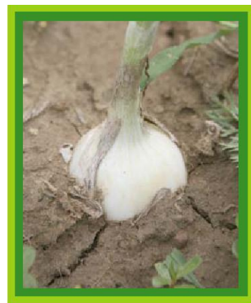
Soil cracks when onions bulb.

When the ground starts to crack as the onions push the soil away, the bulbing process has begun. Stop fertilizing at this point.